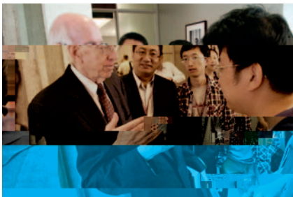
Judge Richard Posner talked with 2012 Summer School scholars after his lecture.

The University of Chicago is the birthplace of "law and economics," and it continues to be the international center for the study of this interdisciplinary field. At the University of Chicago, such brilliant minds as Richard Posner and Nobel laureates Gary Becker, Ronald Coase, and George Stigler have worked together for more than 50 years to change the foundation of legal analysis. Entire fields of law—antitrust, tort, contracts, corporate, and property law—have been completely transformed by law and economics, and nearly every area of law has been affected by it. Law and economics is in every law class and casebook in America, and its tools are used all over the world.